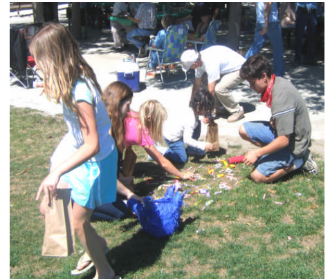
The kids are excited about the candy and coins that they found from the Piñata.