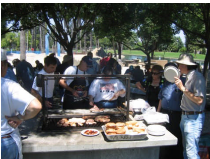
The line just got longer . . .