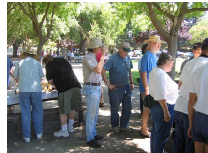
Everyone waiting for the grub to cook!